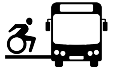
Transit for People with Disabilities and Senior Citizens