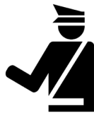
Washington State Patrol