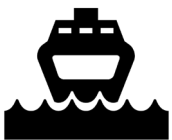
Ferry Service and Upgrades

I-976 would cut $1.3 billion in ferry vessel improvements between now and 2031, and eliminate additional funding options for passenger-only ferry districts. I-976 puts $188 million at risk for a new state ferry and $48 million at risk for upgrades to the Bremerton ferry terminal.