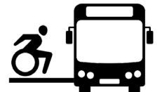
Transit for People with Disabilities and Senior Citizens