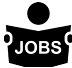
Employment Transportation Programs