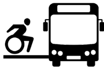
Transit for People with Disabilities and Senior Citizens