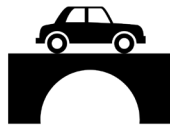
-$26.8 Million I-82 Highway Red Mountain Interchange