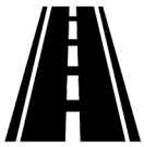
-$135 Million US 12 Highway Walla Walla Corridor Improvements

In the last Biennium, Yakima, Benton, Franklin, and Walla Walla counties received over $15 million in state mobility grants, as well as over $200 million for highway projects budgeted between 2019-2027. Here are a few of the projects at risk: