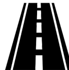
I-405 Highway Widening