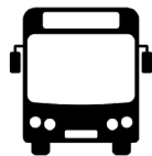
300,000 Hours of Bus Service