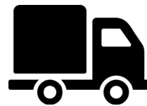
Freight Mobility Projects