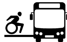
Transit for People with Disabilities and Senior Citizens