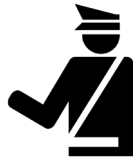
Washington State Patrol