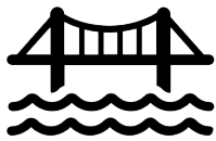
Highway Safety Improvements