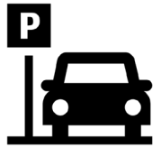
Community Transit Vanpool Service