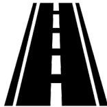
North/South Freeway Project in Spokane